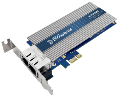
Low Profile 2 Eth ports