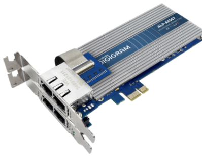
Low Profile 4 Eth ports