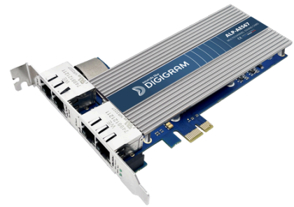
Full-height Profile 4 Eth ports